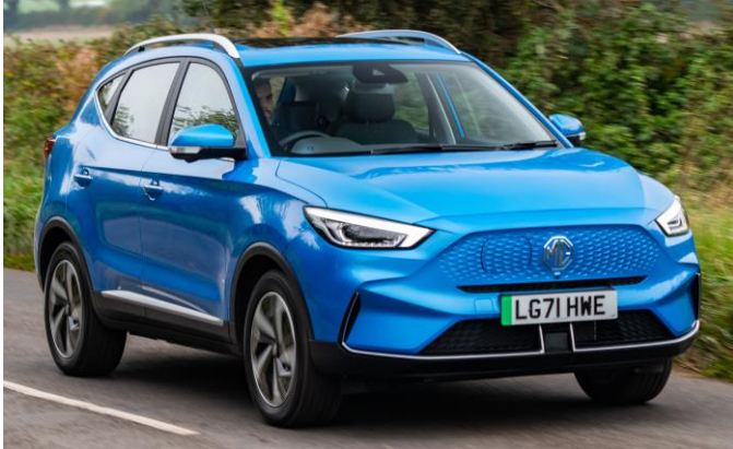
2022 update MG ZS EV.