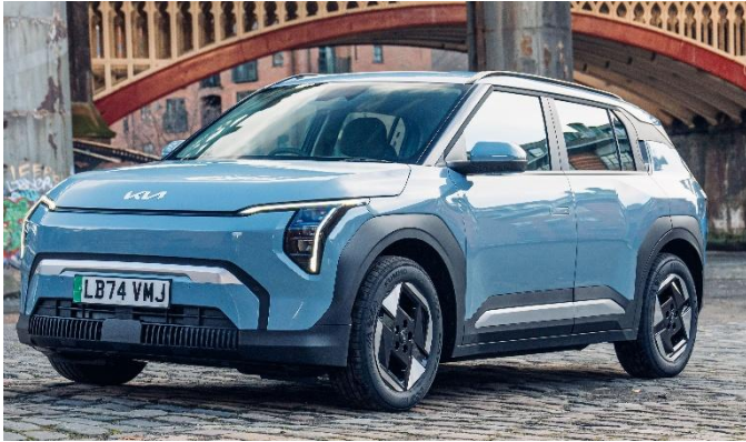
Kia EV3.