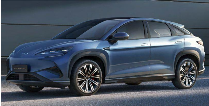
2023 BYD Sealion 7.

Created and written by: Bryce Gatton Contact: Bryce@EVChoice.com.au