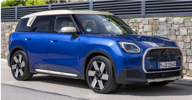
2024 Mini Countryman.

Created and written by: Bryce Gatton Contact: Bryce@EVChoice.com.au