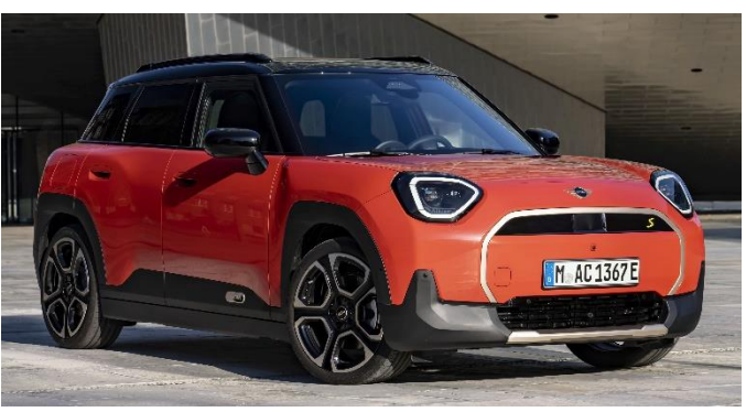
2024 Mini Aceman.

Created and written by: Bryce Gaton Contact: Bryce@EVChoice.com.au