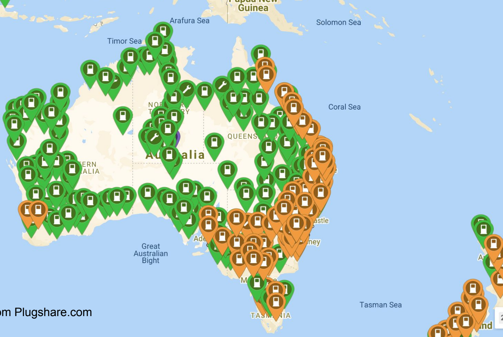
Charger map