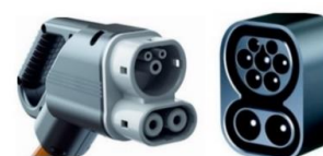
CCS2 charging plug and socket

The Polestar 3 is fitted with a CCS2 socket allowing it to charge via Type 2 AC chargers 2 as well as CCS2 DC fast-chargers.