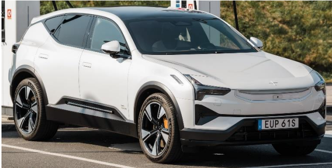
Polestar 3.

Created and written by: Bryce Gatton Contact: Bryce@EVChoice.com.au