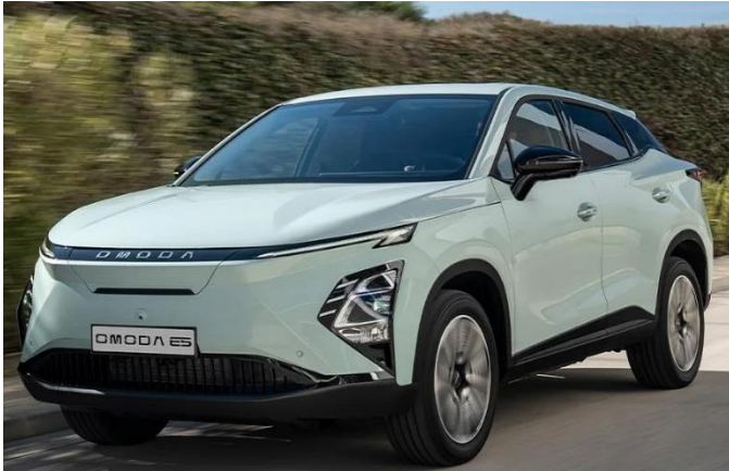
Chery Omoda e5.