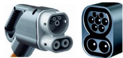
CCS2 charging plug and socket

The Chery Omoda e5 is fitted with a CCS2 socket allowing it to charge via Type 2 AC chargers 2 as well as CCS2 DC fast-chargers.