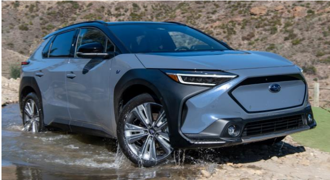
Subaru Solterra.