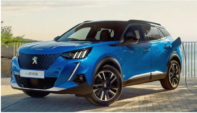
Peugeot e-2008