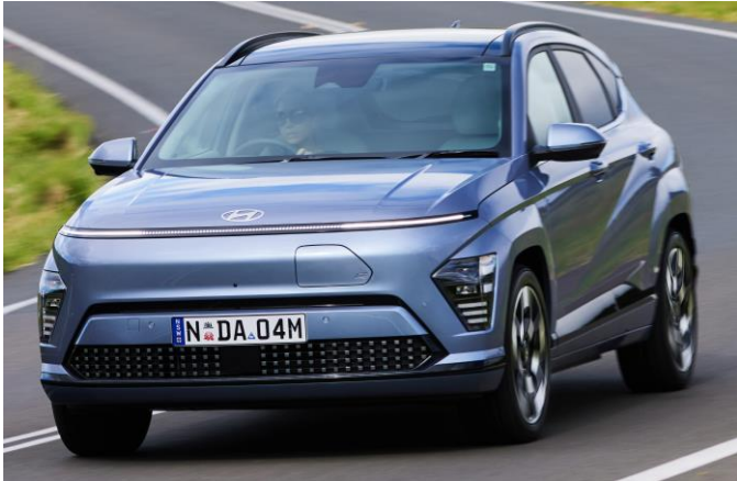
2024 Hyundai Kona electric.