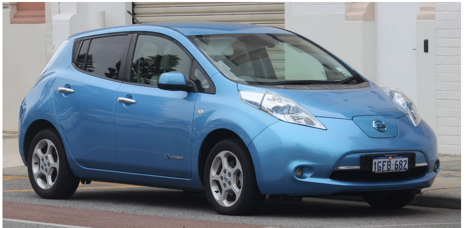
The ZEO Nissan Leaf is the cheapest second-hand EV readily available in Australia. Despite being up to nine years old and with short range compared to modern EVs, they still command good prices, rarely being found for less than $16,000. Many other EVs can sell for as much second-hand as they do new, such is the demand for EVs in Australia, although prices will drop once new lower-priced EVs such as the BYD Dolphin enter the Australian market.

For an EV (be it BEV, PHEV or HEV) nothing changes in relation to the basic checks of the body, suspension, steering, brakes, tyres, interior, air conditioning (including filters), drive train (constant velocity joints, free play etc) and 12V electrical systems. Radiators for the air conditioning and motor/controller cooling circuit still exist and need to be inspected as per normal. (Note: there may be