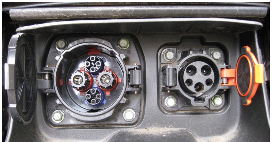
Figure 2: charging sockets in a ZEO Leaf. Left: CHAdeMO DC charging socket. (No new EVs sold here, except the Nissan Leaf, use CHAdeMO). Main current carrying pins are the centre pair (red rings). Right: Type 1 AC charging socket. (No longer fitted to new EVs sold in Australia). Upper two are the current carrying pins. Centre bottom is the earth pin.