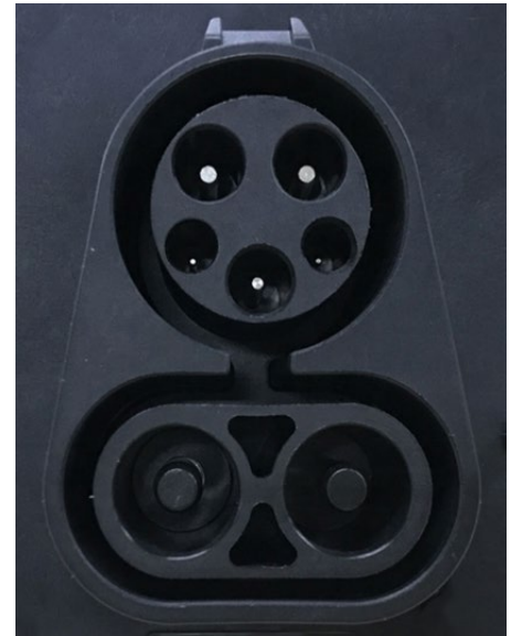
Figure 4: CCS1 Charging socket Found here only in early BMWi3. Upper section is a Type 1 AC socket. Lower two pins are the DC pins, as per the CCS2 socket. This socket is incompatible with Australian DC chargers.

Bryce is a member of the Melbourne branch of Renew and works as the EV electrical safety trainer/safety supervisor for Melbourne University's Faculty of Engineering and Information Technology (FEIT).