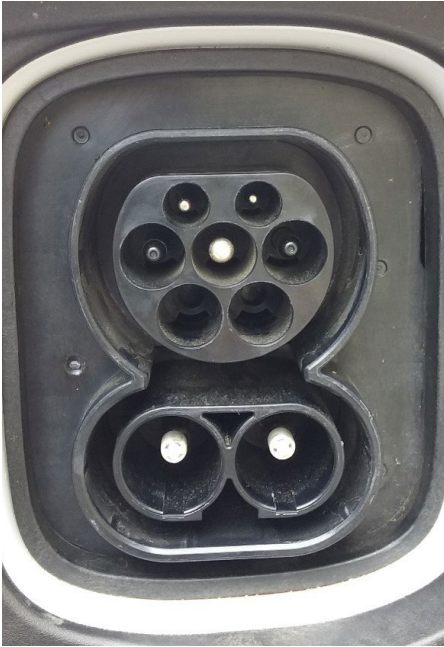
Figure 3: CCS2 charging socket in a Hyundai Kona. This socket is fitted to all new EVs sold here except the Nissan Leaf.