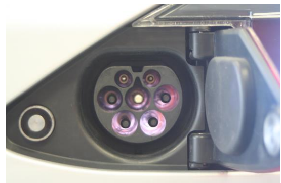
Pic: Tesla modified Type 2 socket (note notch at top to prevent use of Tesla Superchargers with normal Type 2 sockets).

The Model X is fitted with a modified Type 2 socket that does (depending on EVSE to vehicle communications) single phase AC charging, three phase AC charging or DC fast-charging.