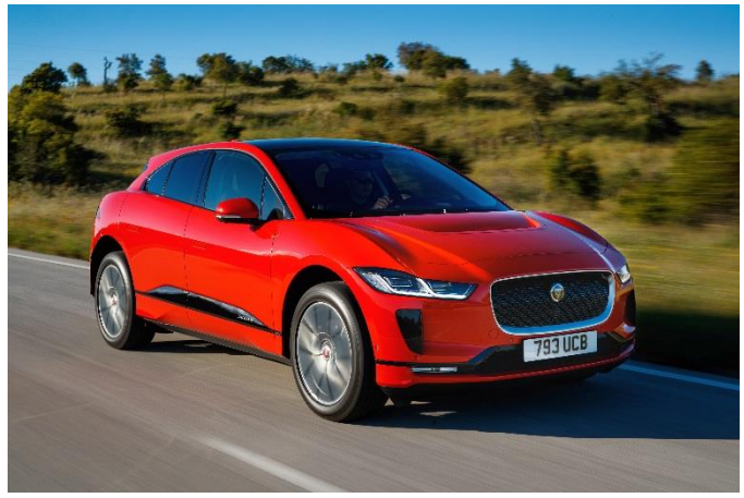
Jaguar I-Pace.