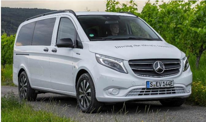
Mercedes eVito Tourer.