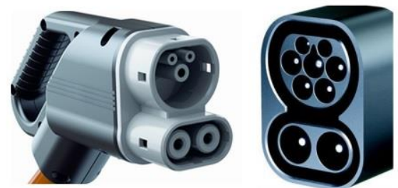
CCS2 charging plug and socket

The eVito Tourer is fitted with a CCS2 socket allowing it to charge via Type 2 AC chargers 2 as well as via CCS2 DC fast-chargers.