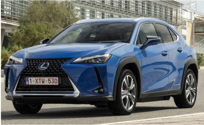
Lexus UX300e.