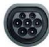
Type 2 AC socket

Note: CHAdeMO leads are being phased out in some countries already, although they will likely be available at most locations here for the life of a new UX300e bought today.