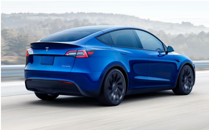
Image: Tesla INTRODUCTION