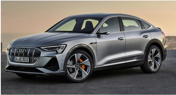
2021 Audi e-tron Sportsback.