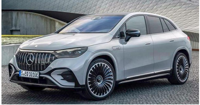
2023 Mercedes EQE SUV.

Created and written by: Bryce Gaton Contact: Bryce@EVChoice.com.au