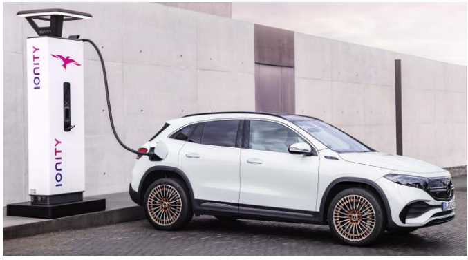
Mercedes EQA.